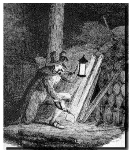
The Popular view of Fawkes

Catholics in England would rise up and depose the new King. This was quite false and out of step with the feeling of people at home in England. They were enthusiastically welcoming him in fact. His view indeed was directly contradicted by Don Juan de Tassis, an envoy from the Spanish King, who sounded out feeling in England, and found the spirit for combat entirely lacking.