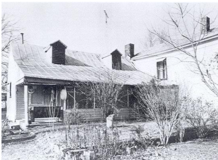
Boyd's Tavern, only remainder of original South Boston.

----- Boyd's Ferry was one of the earliest Dan river crossings established in Halifax County. The ferry crossed about where the Norfolk-Southern Railway bridge crosses the river today. The ferry's importance lay in part in the fact that over it passed the road from the south to Charlotte and Prince Edward Counties, Petersburg and Richmond.